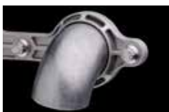
As Cast Flange/ Mill Finish on Tubing