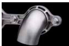
Satin Flange/ Satin Finish on Tubing