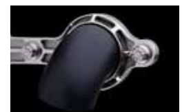
Mirror Polished Flange/ Black Ceramic Finish on Tubing