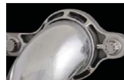
Ceramic Coated Silver