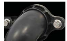
Ceramic Coated Black