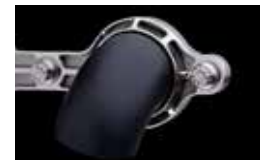
Mirror Polished Flange/ Black Ceramic on Tubing