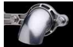
Mirror Polished Flange/ Silver Ceramic on Tubing