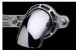
Mirror Polished Flange/ Mirror Polished on Tubing